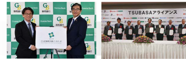
Established Gunma Regional Advanced Solution Partners Co., Ltd. in December 2020 Participated in TSUBASA Alliance in December 2020

Aspiring to be a “regional financial group that can achieve greater value by meeting customer needs through financial service innovation”