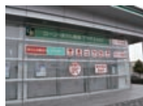
Individual Consulting Plaza EAST (Oizumi Branch)