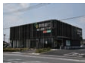
Individual Consulting Plaza Maebashi