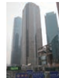
Shanghai Representative Office 18th Floor, Hang Seng Bank Tower, 1000 Lujiazui Ring Road, Pudong New Area, Shanghai, P.R. China