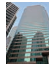
Hong Kong Representative Office Suite 1803, Tower 1, The Gateway, Harbour City, 25 Canton Road, Tsim Sha Tsui, Kowloon, Hong Kong