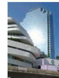
Bangkok Representative Office 689 Bhiraj Tower at EmQuartier, 16th Floor Unit 1612, Sukhumvit Road, Klongton-nue, Wattana, Bangkok 10110 Thailand