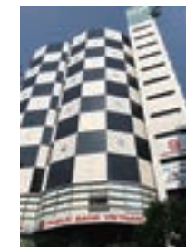
Ho Chi Minh Representative Office Zen Plaza 904, 54-56 Nguyen Trai St., Ben Thanh ward, Dist. 1, Ho Chi Minh City, Vietnam