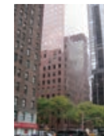
New York Branch 780 Third Avenue, 6th Floor New York, NY 10017