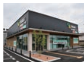
Individual Consulting Plaza Isesaki