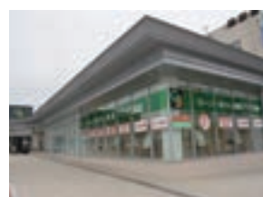
Individual Consulting Plaza Takasaki (Takasaki-Tamachi Branch) (To be relocated December 2022)