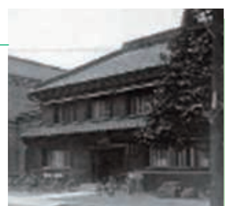
Gunma Daido Bank Head Office at time of founding