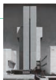
Current head office at time of completion