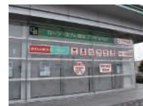
Individual Consulting Plaza EAST (Oizumi Branch)