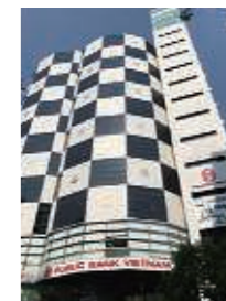
Ho Chi Minh Representative Office Zen Plaza 904, 54-56 Nguyen Trai St., Ben Thanh ward, Dist. 1, Ho Chi Minh City, Vietnam