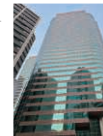
Hong Kong Representative Office Suite 1803, Tower 1, The Gateway, Harbour City, 25 Canton Road, Tsim Sha Tsui, Kowloon, Hong Kong