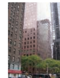
New York Branch 780 Third Avenue, 6th Floor New York, NY 10017 U.S.A.