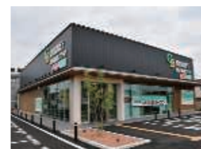
Individual Consulting Plaza Isesaki