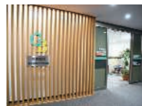
Individual Consulting Plaza Takasaki