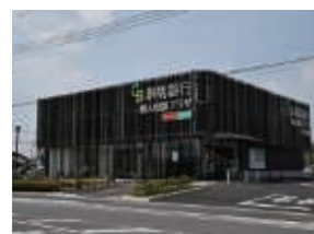
Individual Consulting Plaza Maebashi