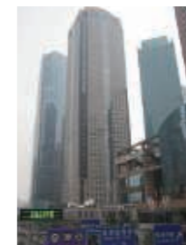
Shanghai Representative Office 18th Floor, Hang Seng Bank Tower, 1000 Lujiazui Ring Road, Pudong New Area, Shanghai, P.R. China