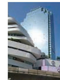
Bangkok Representative Office 689 Bhiraj Tower at EmQuartier, 16th Floor Unit 1612, Sukhumvit Road, Klongton-nue, Wattana, Bangkok 10110 Thailand