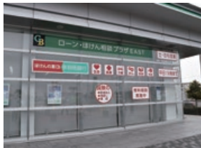
Individual Consulting Plaza EAST (Oizumi Branch)