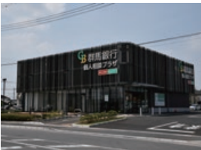
Individual Consulting Plaza Maebashi