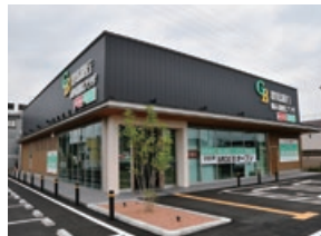
Individual Consulting Plaza Isesaki